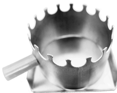
Low Mode (Simmer or Dry Bake)