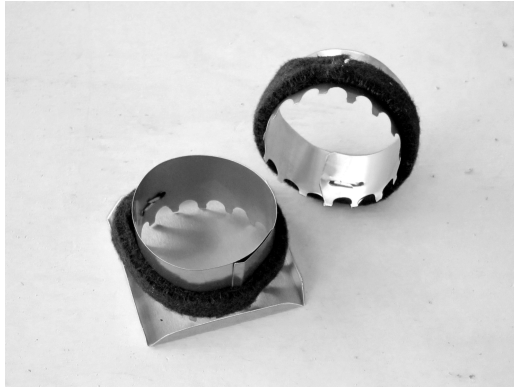
The Epicurean Titanium UL15 Stove