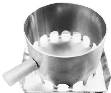
High Mode (Boil)