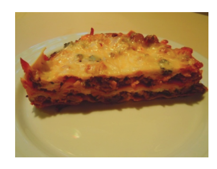
Servings 2 (Calories 682)